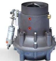
Inlet valves with continuous capacity control