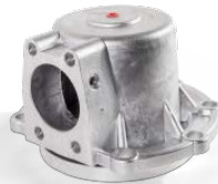
Minimum pressure / Discharge valves