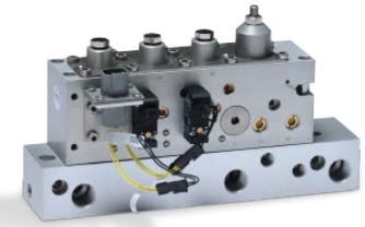
Compressor control modules with integrated valves