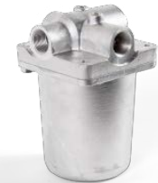
Oil-filter bodies with bypass